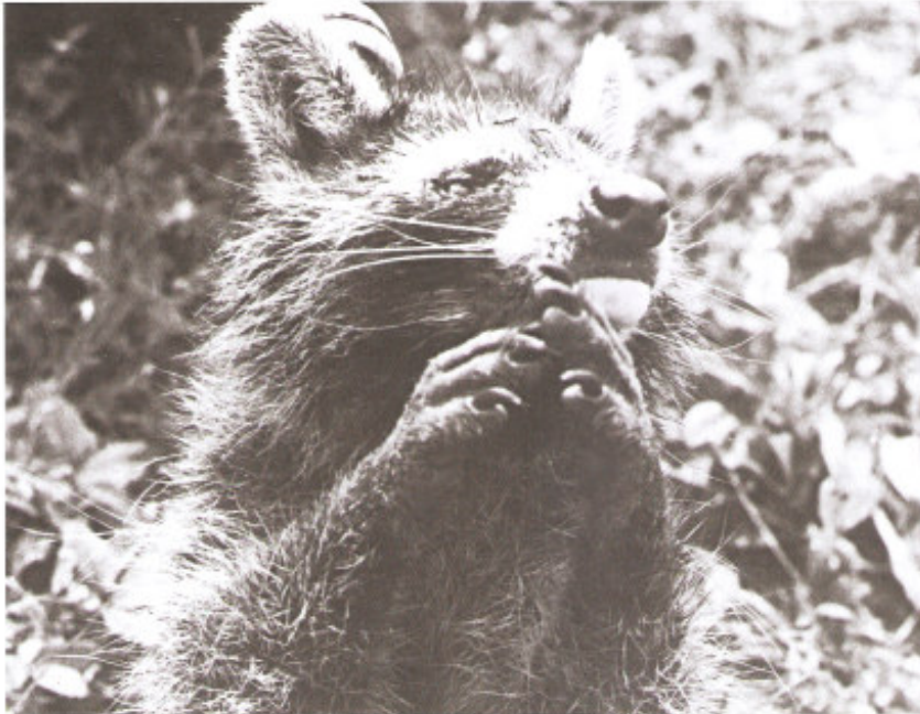
In this picture you see a raccoon infected with canine distemper. You can see by looking at this raccoon what a terrible disease this is.

This disease is almost 100 percent fatal in both wild animals and dogs and cats. Distemper, just like mange, is a long and drawn out cruel way to die, and is only prevalent when wild animal populations reach high levels.