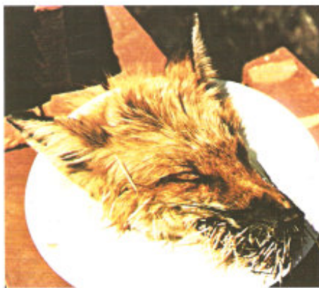
This is a picture of a rabid fox's head. The fox, in the "furious" stage has attacked a porcupine, something only a rabid fox would do.

Infected animals in the terminal stage of rabies may have either "furious" or "dumb" rabies. In the "furious" stage the animal acts crazy and may attack anything from a tree to an elephant without being provoked. In the "dumb" stage the animal may act tame and be able to be handled.